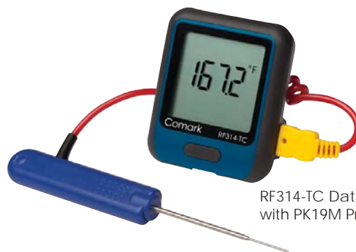
RF314-TC Data Logger with PK19M Probe