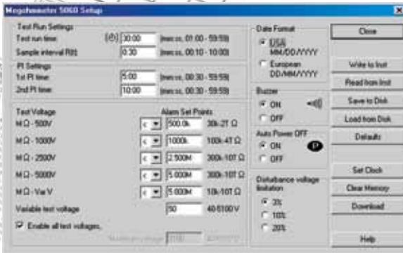
Clear and easy setup from one dialog box for Model 5060.