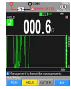
HOLD Management and hold of the display