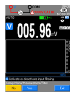
Measurement Configuration of the measurement parameters