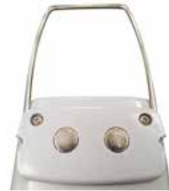
Model: 911-910 Tilt Stand, Magnet, Hanger for 911B, 912B, 931B, 932B, 940A, 945A Hanger attaches to back of handheld thermometer to free hands while taking temperature measurements.