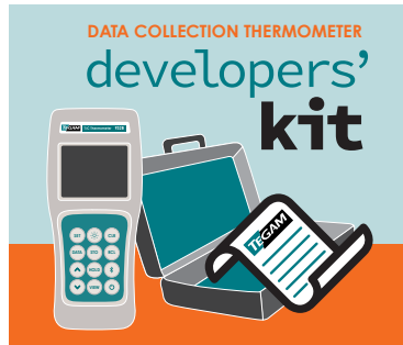
Model: Software Developers' Kit • Bluetooth LE radio dongle • Example Windows 10 executable application, source code, and build instructions (implements all features of the 930 series thermometer) • Example Code for iOS and Android™ Apps • Documentation for Bluetooth LE interface • Invitation to private TEGAM User Forum • TEGAM 931B or 932B Data Collection Thermometers must be purchased separately