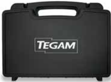
Model: 911-911 Case for 911B, 912B, 931B, 932B, 940A, 945A