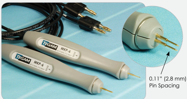
MKP-6 Probe Set with "B" Style Pins Installed