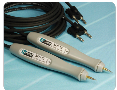
TEGAM BKP-10 Kelvin probes used to measure contact resistance between shunt and circuit board trace

Power is from internal rechargeable NiCad cells, and/or 110/220 VAC, 50/60 Hz power line. Power consumption is less than 10 W. The battery charges any time the line cord is plugged into a power receptacle. Battery charge time, from a discharged condition, is less than 8 hours for a full charge. Battery charge lasts for 140 operating hours maximum, and typically 60 hours.