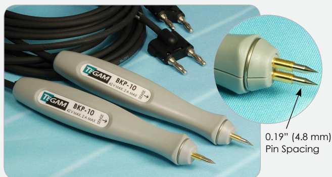
BKP-10 Probe Set with "B" Style Pins Installed