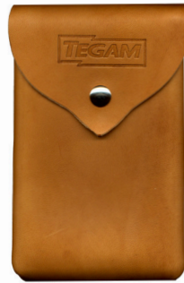
1104 Utility Belt Carrying Case

The 1104 case protects your voltmeter and probes from broken displays, and other damages that can occur. This case has a 2 inch belt loop. It is long lasting, super durable, and is made from top-grain cowhide with riveted seams.