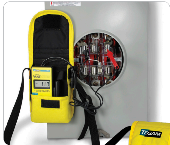
1204A Lineman's Carrying Case

Overall size is 5 1/2 in x 7 1/2 in x 1 1/2 in (W x H x D).