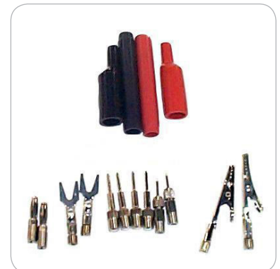
12502 Universal Adapter