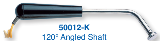
50012-K 120° Angled Shaft Surface Bell Probe