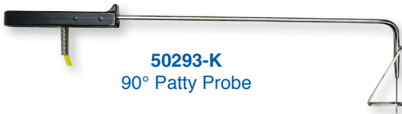
50293-K 90° Patty Probe