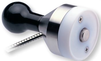
50014-K Weighted Griddle Surface Probe