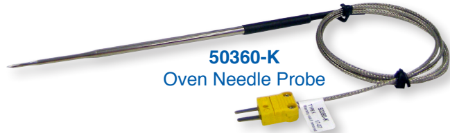
50360-K Oven Needle Probe