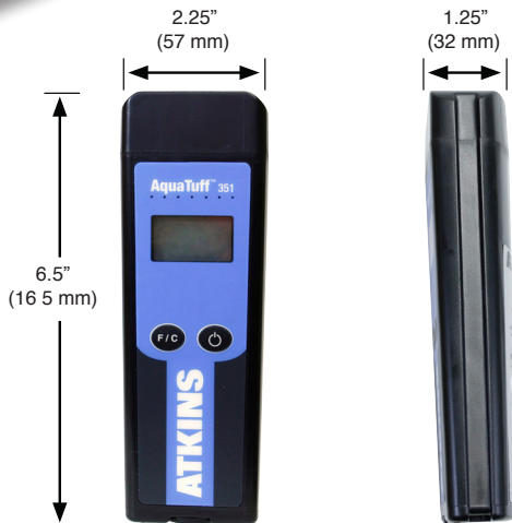
35100-K and 35200-K units have the same dimensions