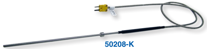
50208-K Fry Vat Probe