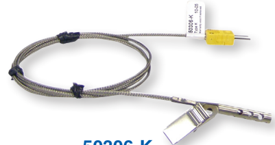
50306-K Oven / Freezer Probe