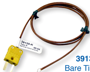
39138-K Bare Tip Probe