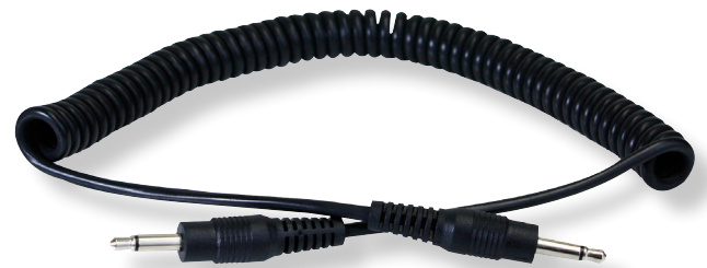
9314 Dual Jack Prover Cord