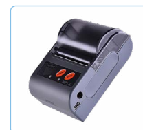
Bluetooth® Printer (Si-AQ Bluetooth® Printer)