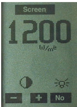
Adjust contrast and activate backlight