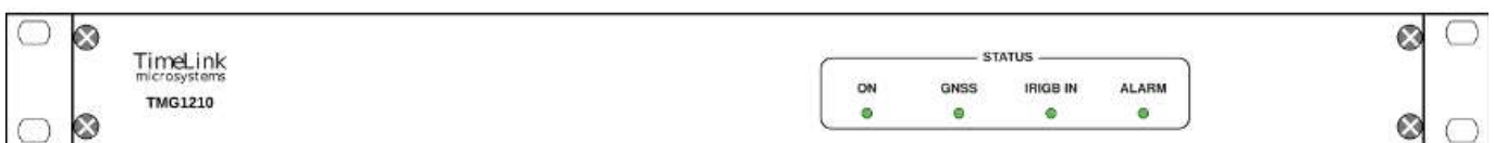
TMG1210 front panel

The overall configuration of the unit is stored on a removable SDCARD memory which allows remote software update easily.