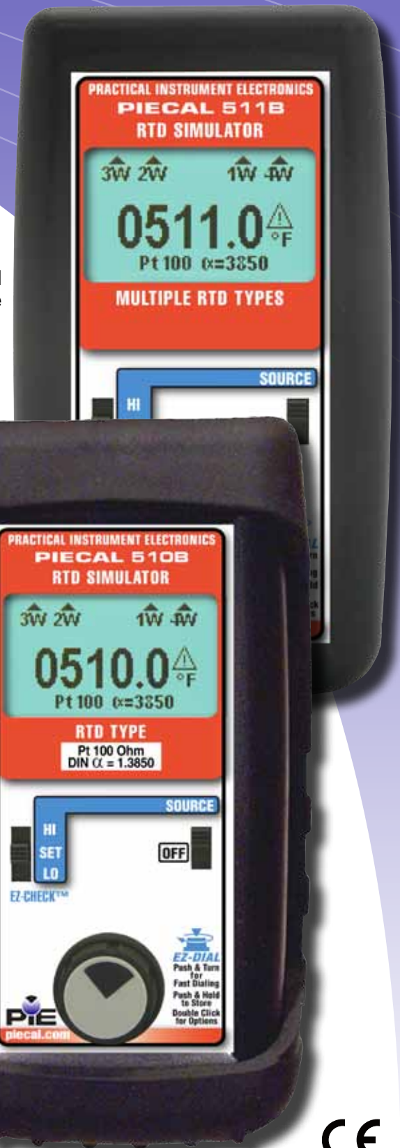
Actual Size (Shown with optional boot)

* PIECAL Calibrators are not manufactured or distributed by Fluke Corp or Altek Industries Inc, manufacturers of Altek Calibrators.